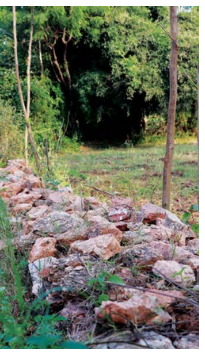
Photo (above) : Land Bunding to withstand the force of water. (below) : Image depicting the developed pastureland on the left of fence.