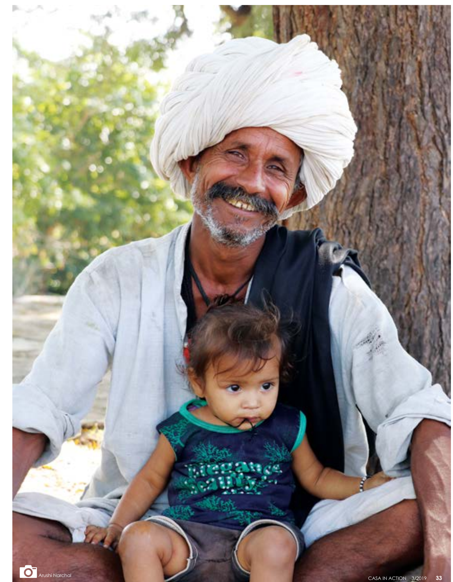
Photo: (right) a farmer attending meeting organized by CASA about the Climate Change adaptation.

Villages are an important part of our economy which are often neglected. "Working with a local partner was very advantageous as they already knew about the basic livelihood patterns of the communities." In the wake of the climate crisis, CASA is relentlessly working towards the Sustainable Development Goals.