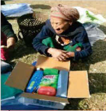
Lemtui with Relief material