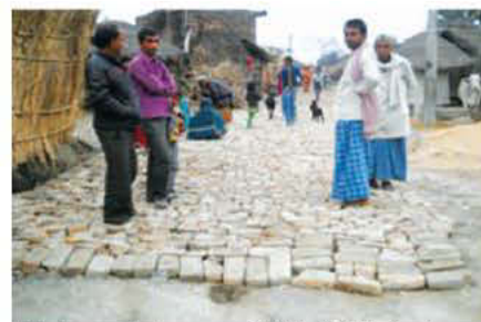
Road construction in progress at VirtiTola of Mathiya Panchayat

In response, all the officials came forward and assured the people about the construction of the road at an early date. The first step of the initiative of the community with their representatives showed good result towards realisation of their rights. Virti Tola is no more a secluded village at a deserted corner of the country. Now the people here use transport facilities to ferry materials up and down to the cities.