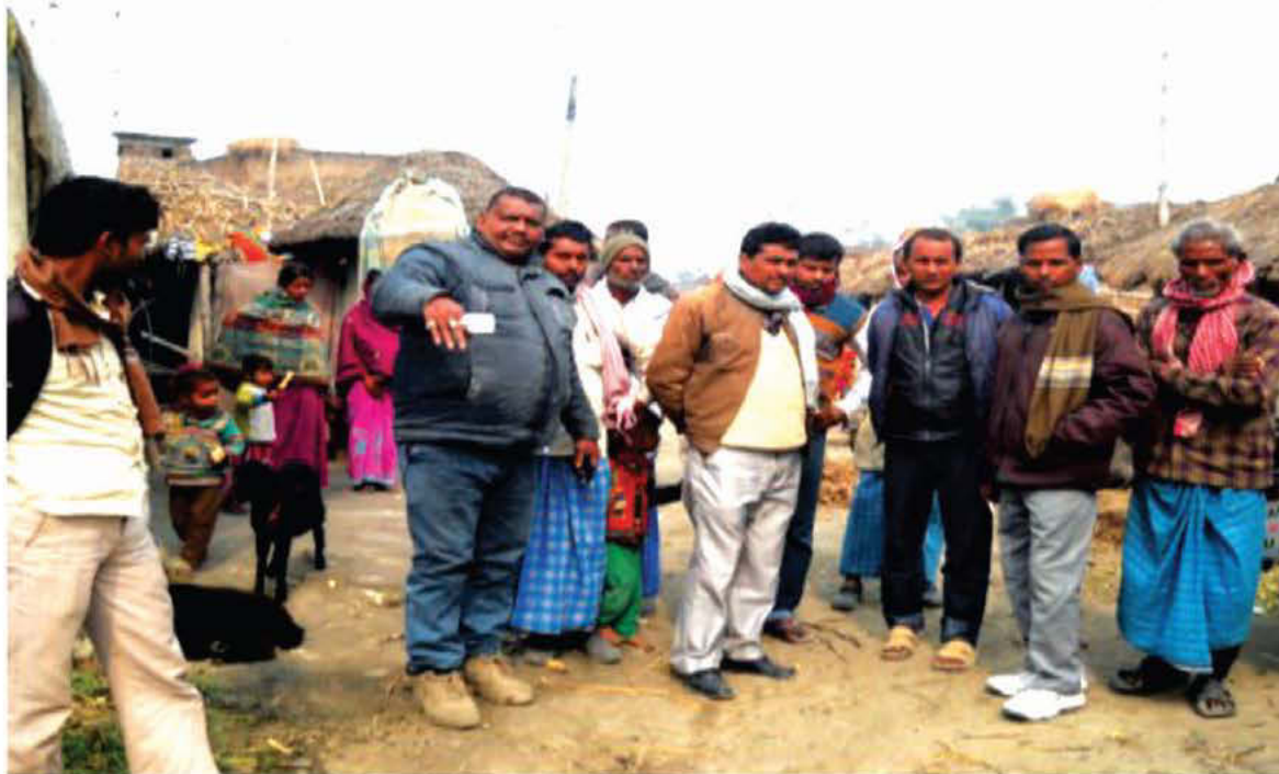
Members of Ambedkar Gram Vikash Sangarsh Samiti conducting the initial survey of road construction.

Bihar's Virti Tola village has majority of population from marginalised sections of the mainstream society, where the benefit of the government schemes barely reached the people even after 68 years of independence.