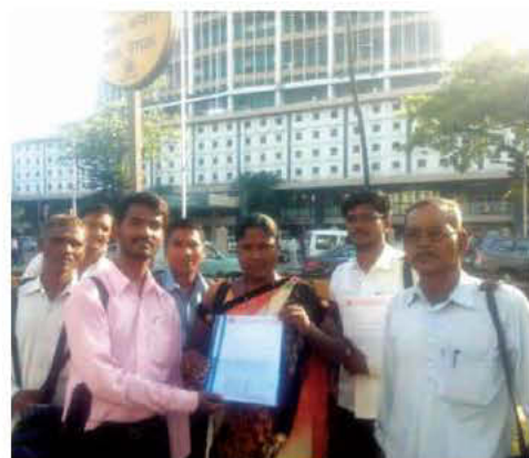
Members of Lokshahi Janhaque Andolan, Maharashtra