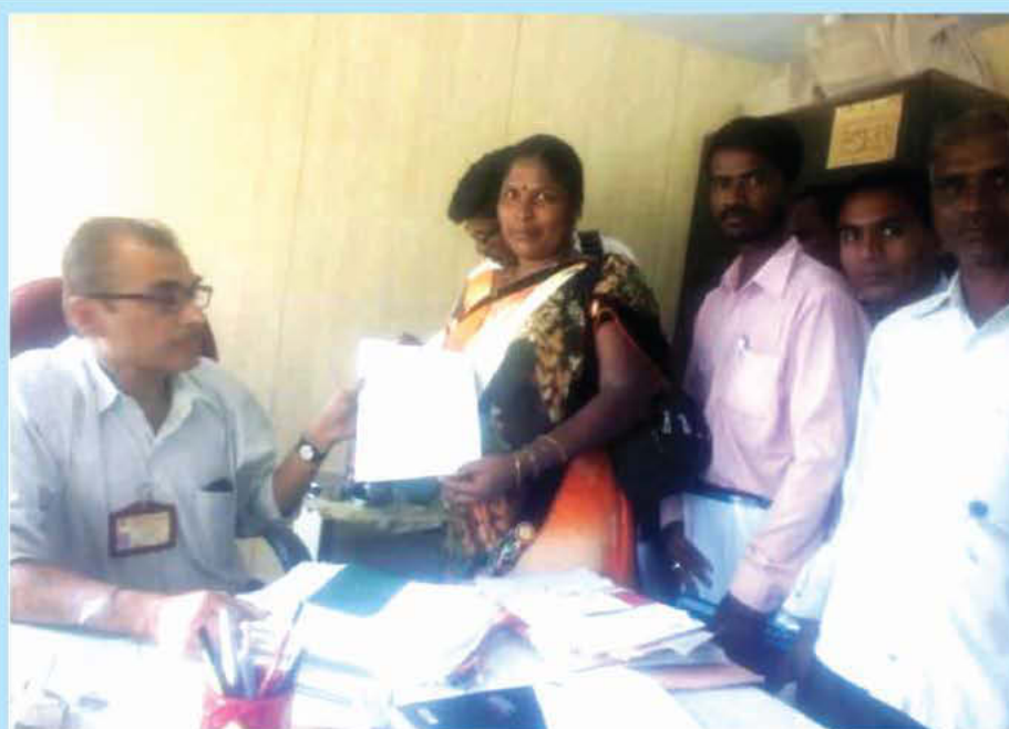
Representatives of state platform submitting memorandum to Shri Hemant Wadhekar, Chief Secretary - Food and Civil Supplies Mantralaya

The organization has an advocacy-based approach to address issues like proper implementation of National Food Security Act (NFSA) 2013, Forest Rights Act (FRA), MNREGA and other social security schemes in 5 villages each from every district and Yavatmal.