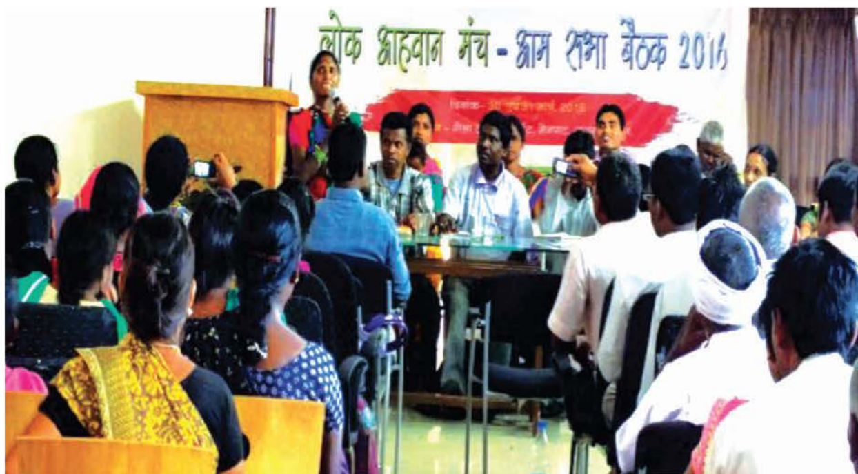
Tribal community from Chhattisgarh participates in the Annual General Meeting

Proper implementation of MGNREGA, food security, forest and land rights were some of the issues that were discussed at the 'Annual General Meeting' workshop held in Chhattisgarh from 30th to 31st March.