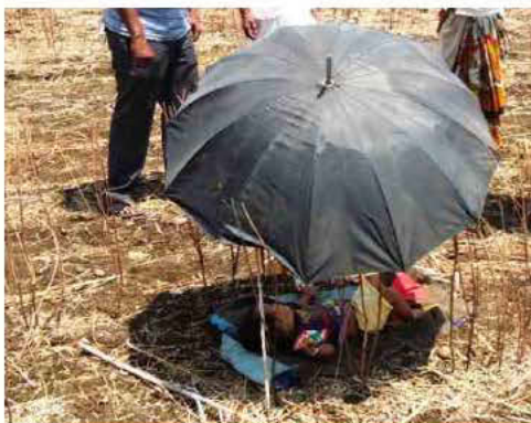
An infant rests under a shade in almost 45° celsius while his parents are working for FSCM