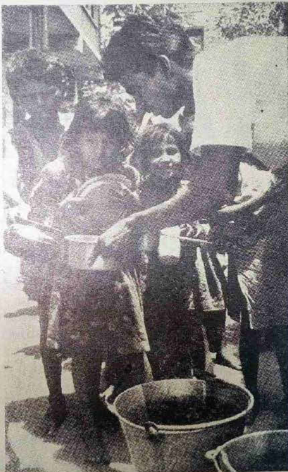
Children queue up to receive their rations in a feeding programme of the National Christian Council Relief Committee.

In addition, there are 7,250 Tibetan children, receiving 14,500 pounds of milk each month.