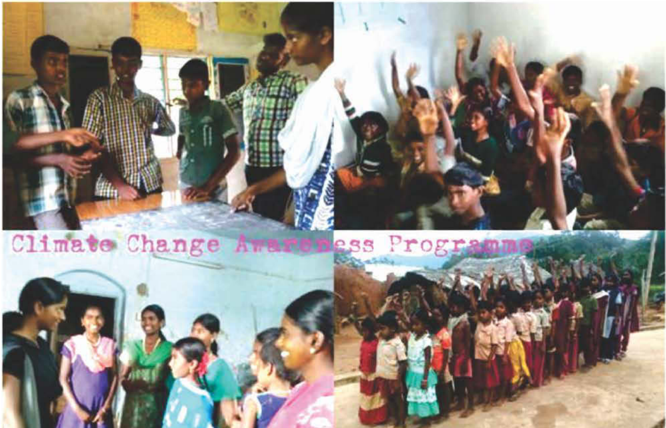
Climate Change Awareness Programme

CASA staff mobilising children for various activities in Dindigul district of Tamilnadu.