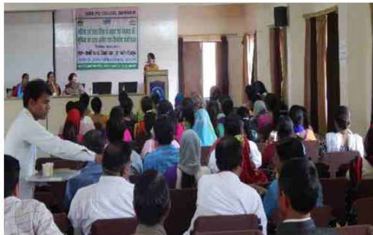
Participants of workshop on violence against women

CASA along with Mountain collective members of Himachal Pradesh and Uttarakhand i.e Manav Seva Sanghtan Bilaspur, Ekal Mahilla Aevam Kalyam Samit, SEED & Kumon Seva samiti, organized Series of workshop on violence against women in the month of December to march in Solan, Rishkesh, Bilaspur & Dehradun. Content of the workshops were focused on Violence against women, children and Role of Panchayat.