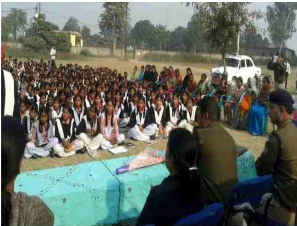
Girl students take lessons from officials on various forms of violence against women

The workshop aimed to make women and people aware about the injustice done to women. All the issues related to women such as female feticide, domestic violence, rape, assault, molestation, sexual harassment etc. were highlighted. Women were sensitised about their rights and dignity.