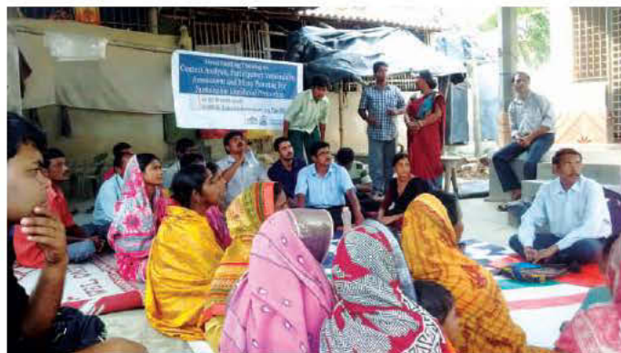
People participate at the hand-holding training session in Sunderbans

Recently, a few groups in Sunderbans have demanded from the political parties to include the climate change issue in their manifestoes for the West Bengal Assembly elections.