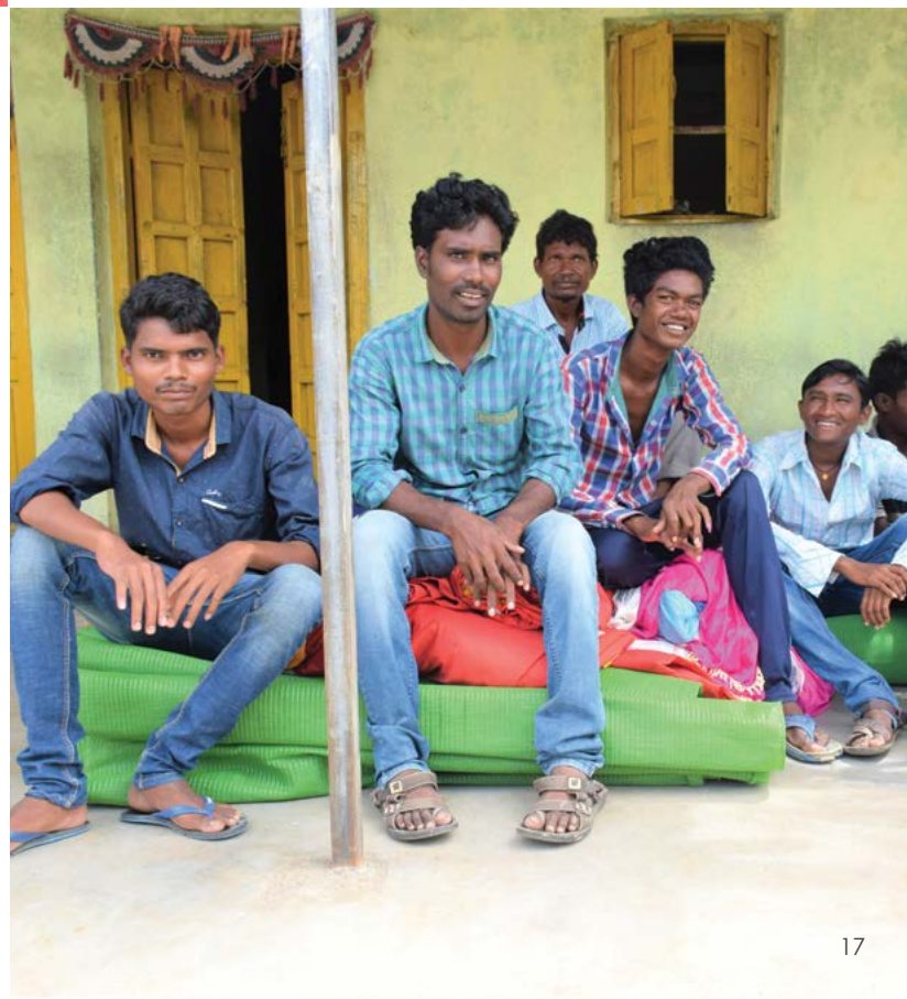
Photo: (Above) Women SHG members removing husk and polishing lentil using a Toor Dal Machine in Maharashtra. (right) a youth group given musical instrument and proper training to facilitate alternate income generation.