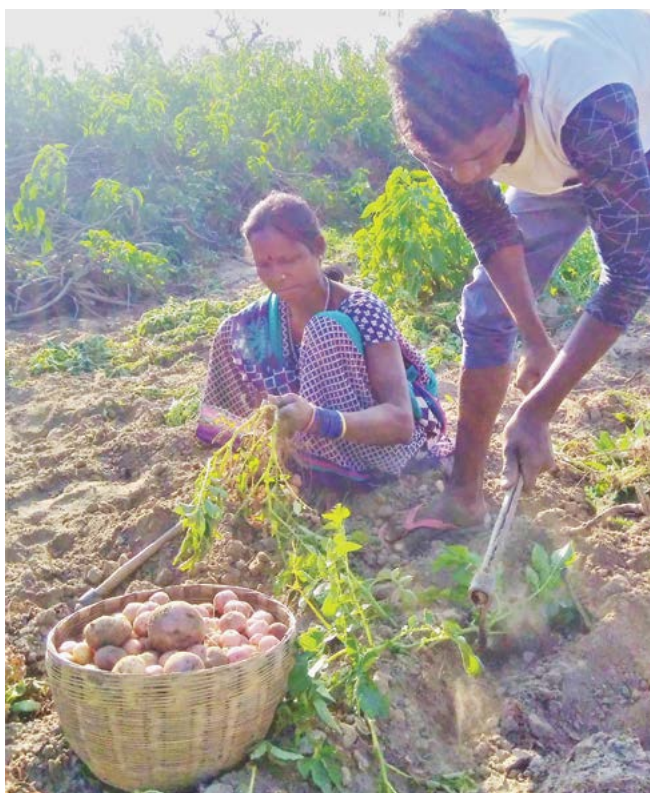
Photo: (Left) members of a family started cultivation of potato as an alternate crop production initiated by CASA.

19 People Organisations have emerged to address issues collectively