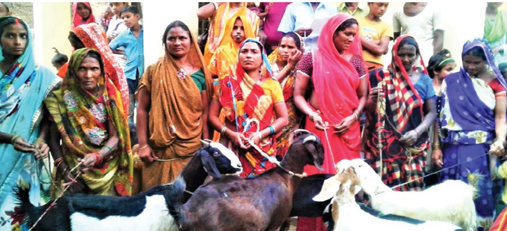
Photo: (Above) A CASA woman beneficiary with her granddaughter in UP (Below) Women SHG members receiving goat pairs.

941 families are involved in kitchen gardening and preparing organic manure by following NADEF Method of composting