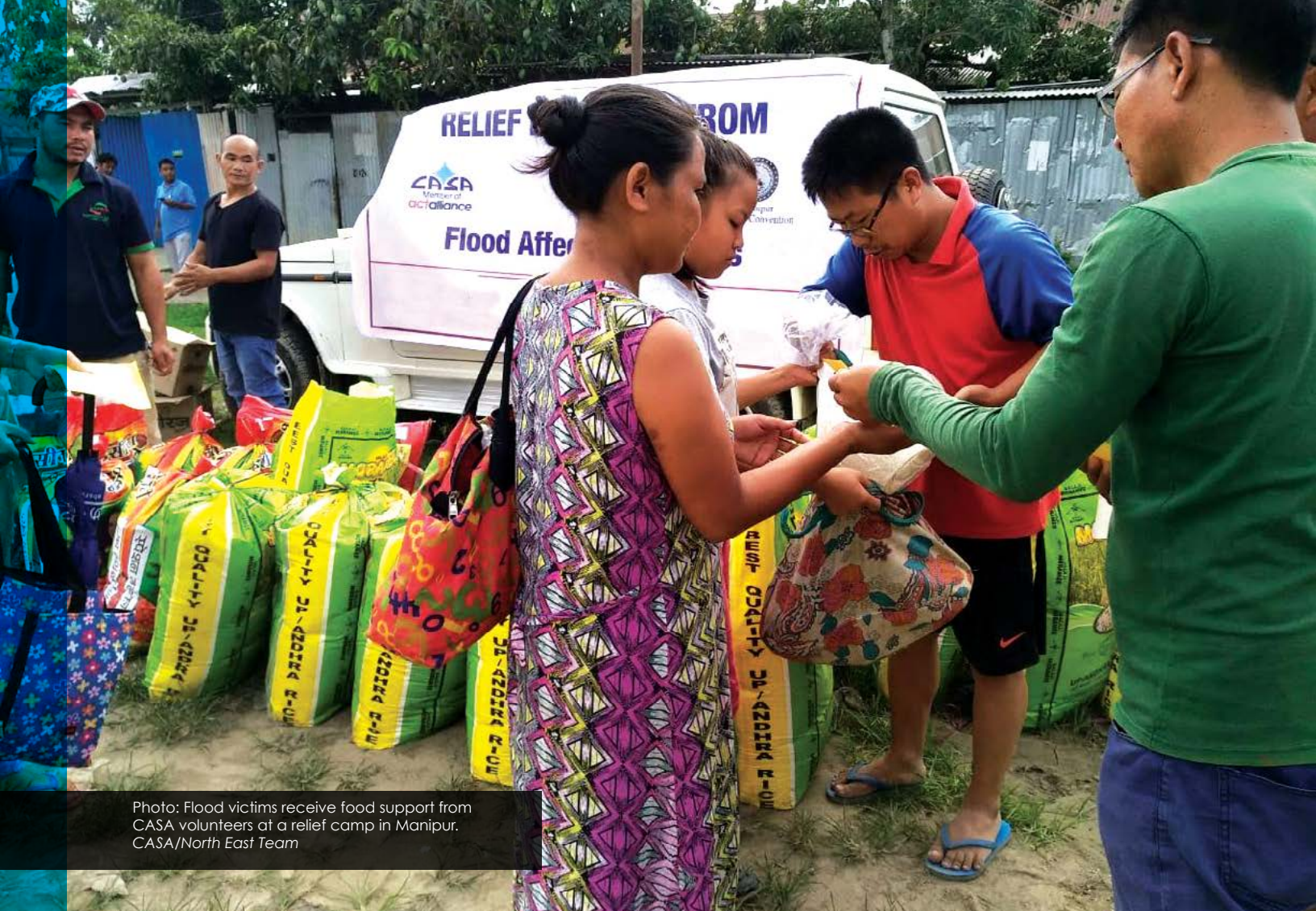
Photo: Flood victims receive food support from CASA volunteers at a relief camp in Manipur. CASA/North East Team