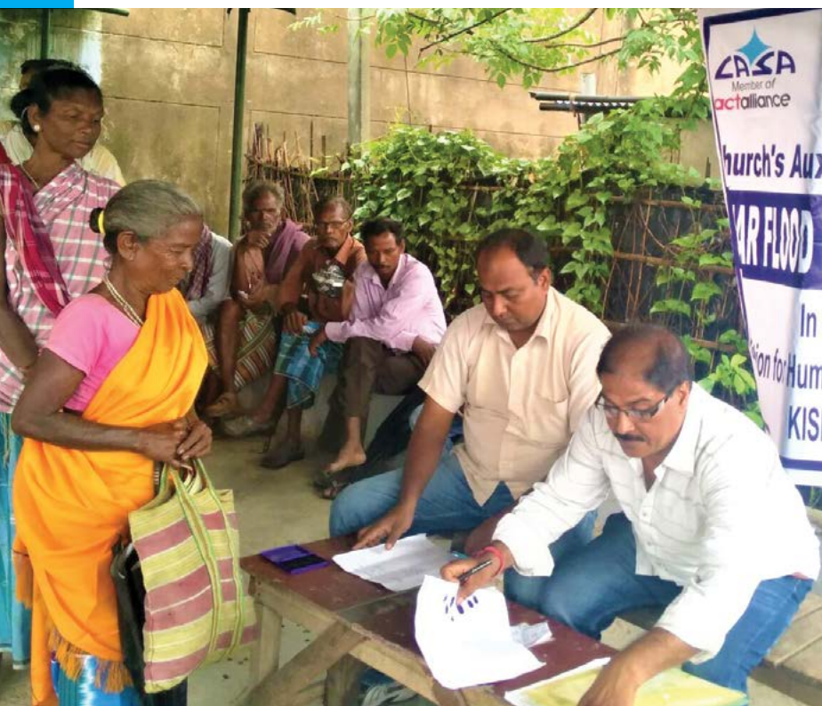
Photo: (Above) a woman struggles to cross an inundated road in Bihar during floods. (below) beneficiaries receiving food support.

The proposed food items were decided based on the current situation of the affected communities and their most urgent needs. The target communities were displaced and living in shelter camps for many days.